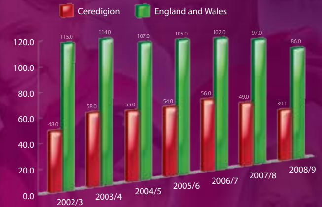
Home Office Crime Statistics from 2003-2009 showing offences per 1000 of population.

Kingdom and has great beaches, rolling hills, and unspoilt scenery wherever you look. You really can't ask for a better place to study. Your quality of life at Aberystwyth will be seriously hard to beat; in fact many students don't want to leave Aberystwyth University even when they have completed their degree!