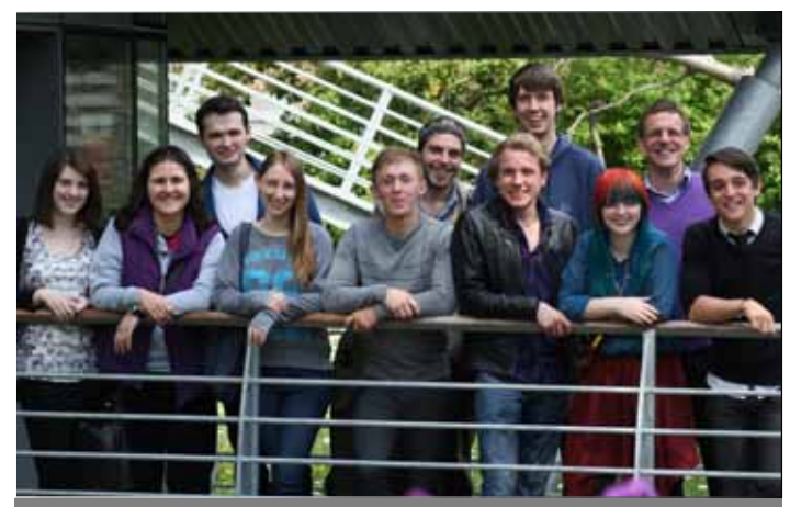
Aberystwyth Psychology Students who made a major contribution to securing the department's British Psychological Society accreditation.

The announcement was made following a successful accreditation visit on 19 June by the British Psychological Society.